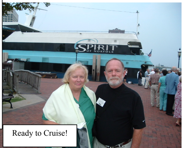
Ready to Cruise!