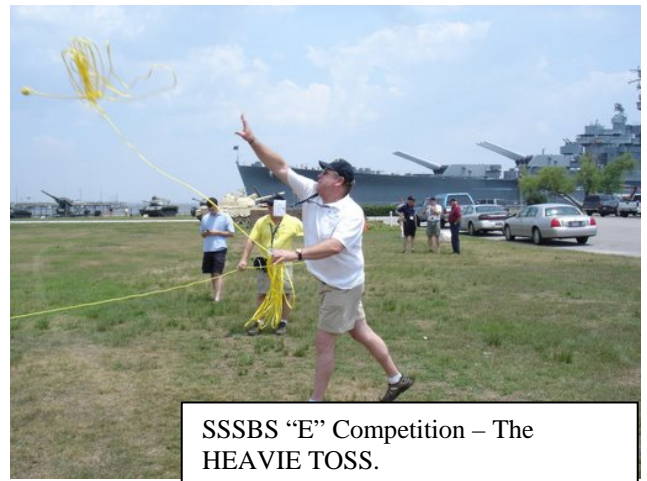
SSSBS "E" Competition – The HEAVIE TOSS.