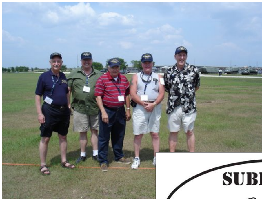
Winning Sea Leopard Team (for Hot Straight & Normal Drills)

However... when the QUAL QUESTIONS were evaluated, the SEA LEOPARD won by a wide margin, so we leave Reunion 2007 with the SEA LEOPARD (SS483) in possession of the SQUADRON “E” award. I think the competition was fair and unbiased and I am hoping that this inspires us all to be willing to get the “E” back for the Sirago whenever the “SUBRON Six Smoke Boat Sisters” come together again (2011).