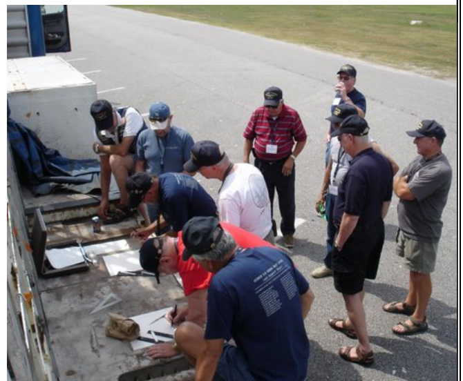
Maneuvering Board Drills (SSSBS Competition) – Compute Course, Speed & Closest Approach.