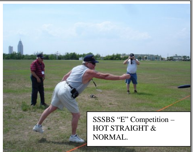
SSSBS "E" Competition – HOT STRAIGHT & NORMAL.